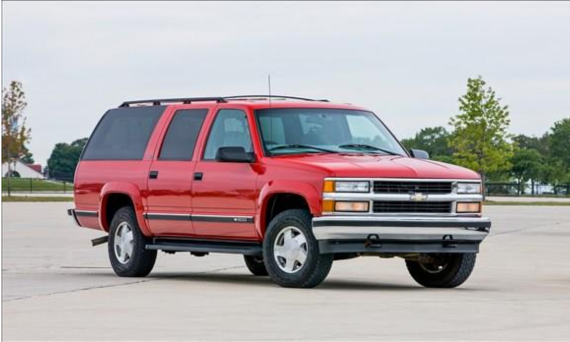
1999 Chevrolet Suburban