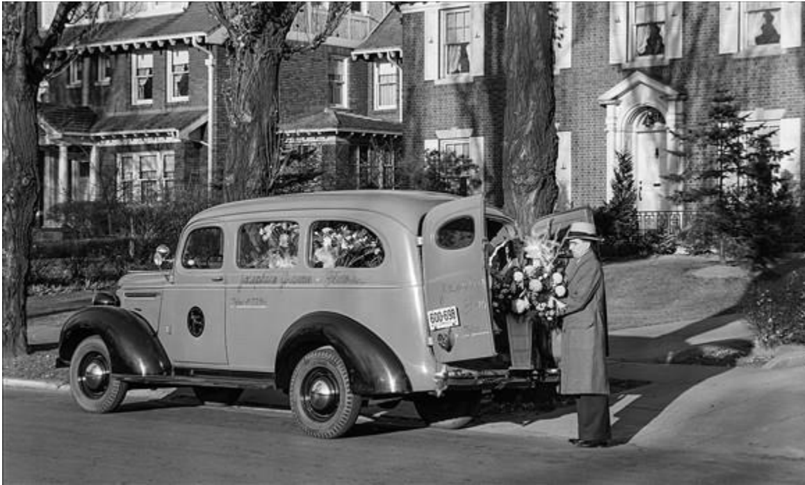
1939 Chevrolet Suburban

The output of GM's Stove bolt inline six-cylinder engine jumps to 79 horses, and additional style changes give this Suburban a look that lasts until 1956.