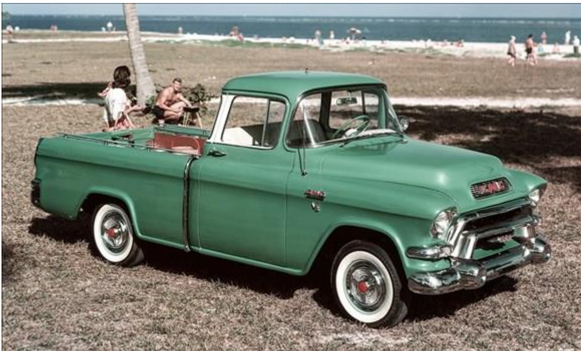
1955 GMC Suburban Pickup

Vimeo # 4 - Chevrolet - https://vimeo.com/36319042 1-min. 45-seconds