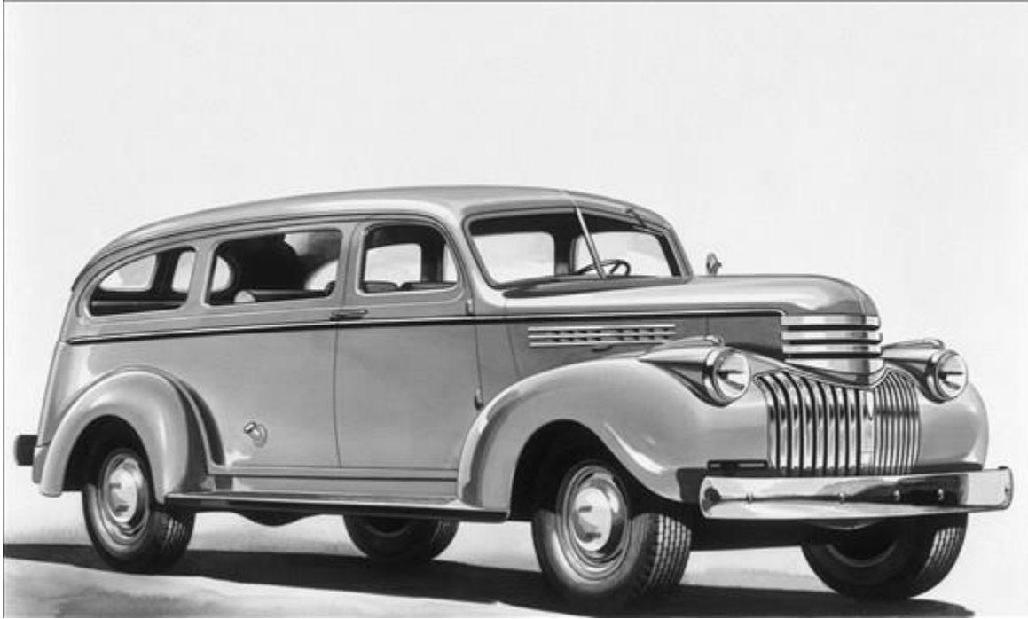
1946 Chevrolet Suburban

Vimeo # 2 - Chevrolet - https://vimeo.com/87748529 1-min. 15-seconds