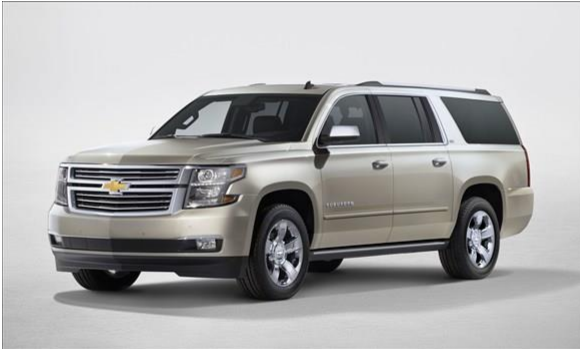
2015 Chevrolet Suburban