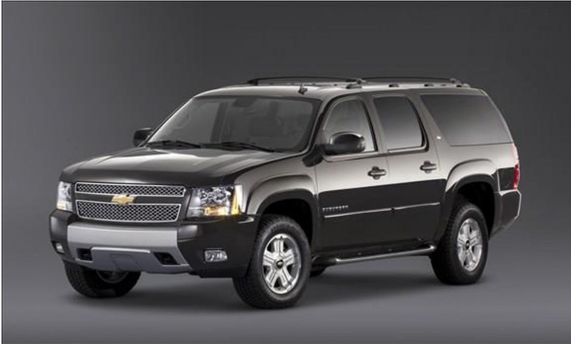
2014 Chevrolet Suburban

Sleeker and more dynamic-looking, this generation drops the traditional chrome bumpers for body-colored fascia. The Suburban celebrates its 75th birthday with an Anniversary Diamond Edition.