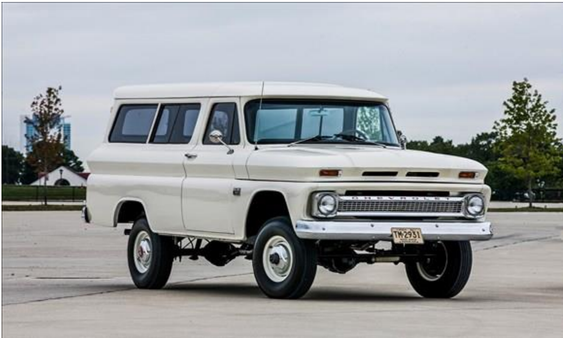
1966 Chevrolet Suburban

Vimeo # 5 - High Mileage - https://vimeo.com/45579844 4-min. 40-seconds