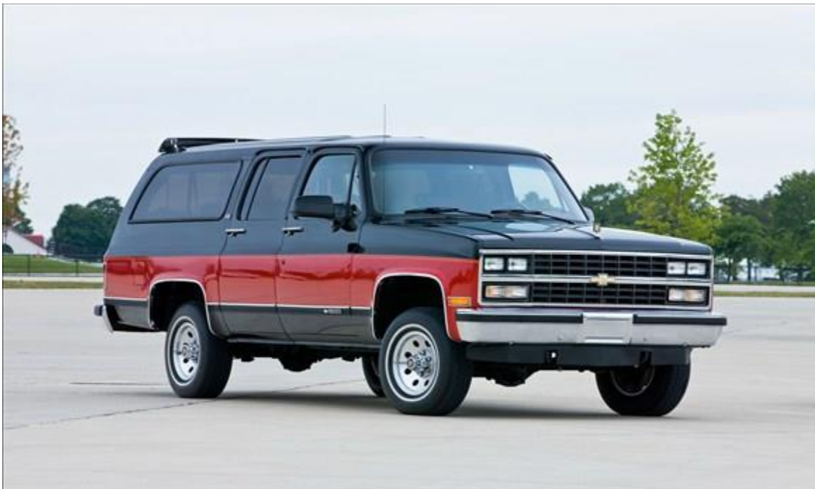
1990 Chevrolet Suburban

Vimeo # 7 - Making Of Chevrolet Heartbeat - https://vimeo.com/13878837