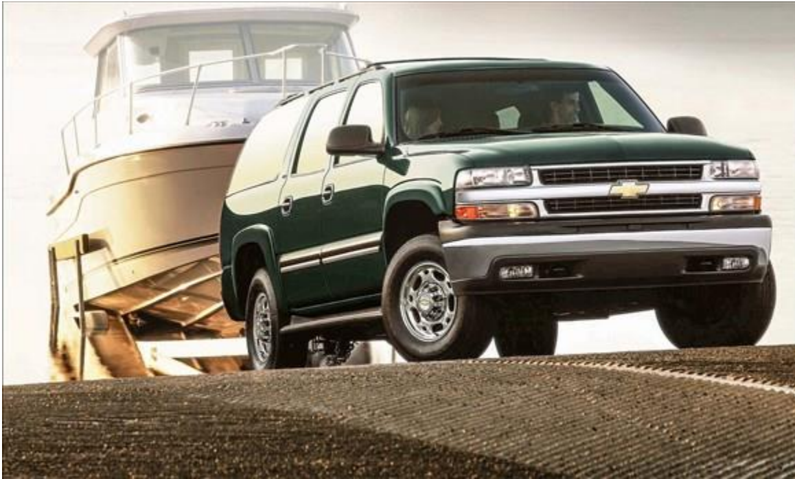
2002 Chevrolet Suburban

The Suburban enters the 21st century with a new look and new powertrains, including a 6.0 - liter V-8 first put in the Corvette Stingray . The interiors are overhauled and the exterior becomes much more polished. Other features include four-wheel disc brakes and a load-leveling suspension system.