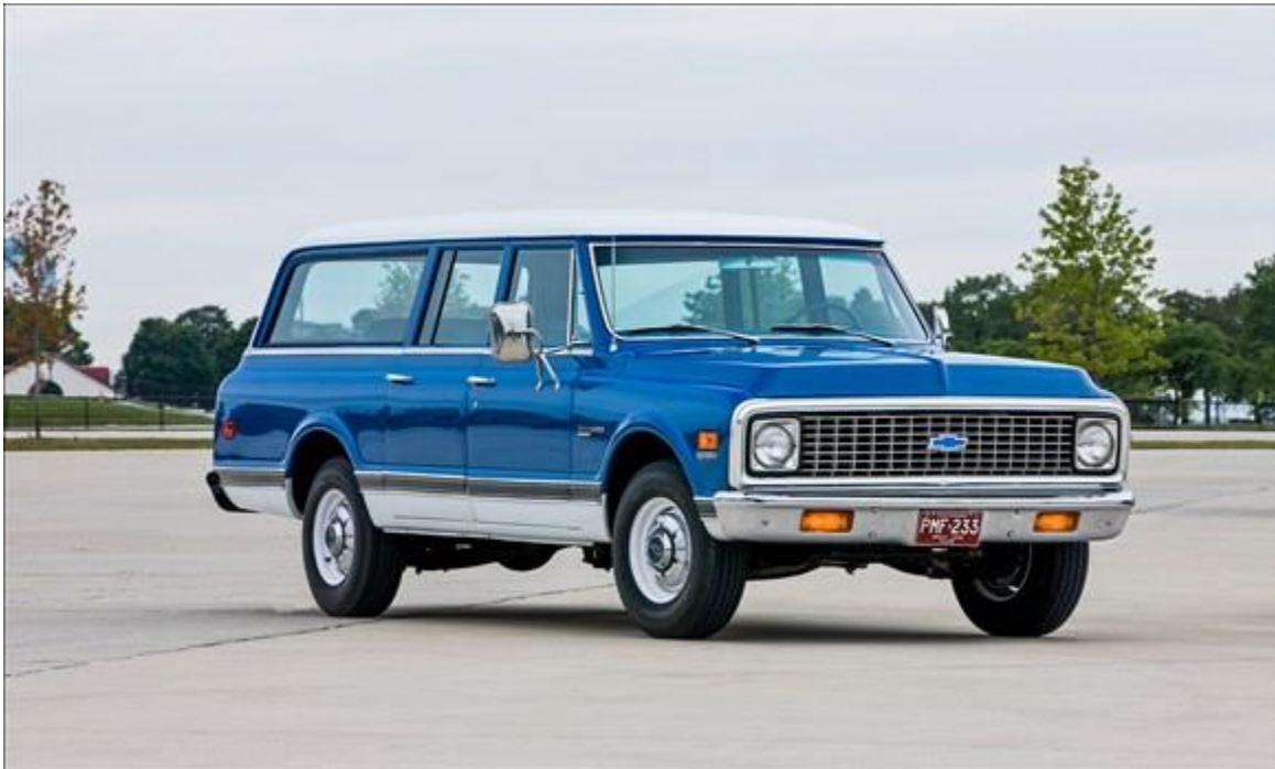
1972 Chevrolet Suburban

Vimeo # 6 - Chevrolet "Volt" - https://vimeo.com/24188799 0-min. 31-seconds