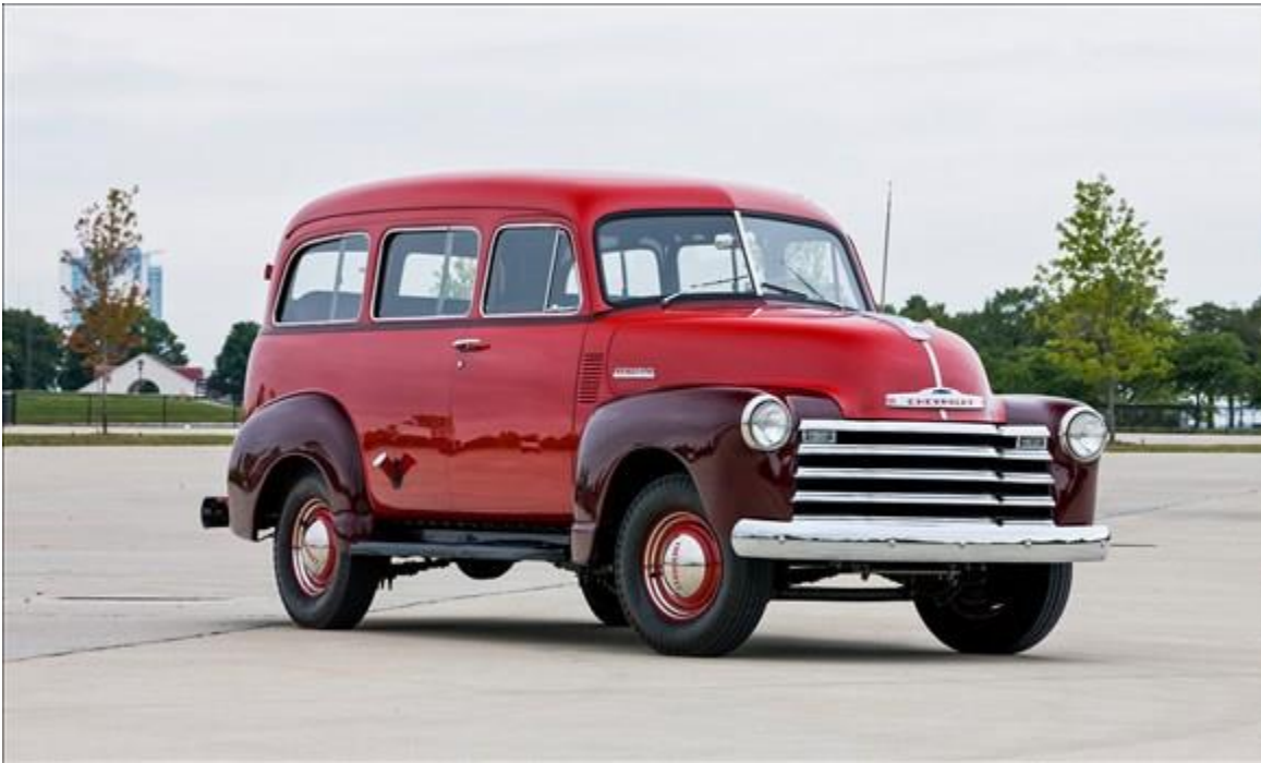
1951 Chevrolet Suburban

Vimeo # 3 - Chevrolet - https://vimeo.com/32128196 0-min. 30-seconds